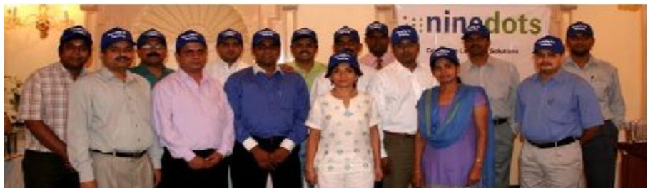
First batch of participants for the Six Thinking Hats Workshop held in February 2007